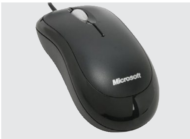
Compromised USB mouse